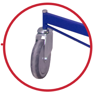
Easy-Roll 6" Caster Wheels