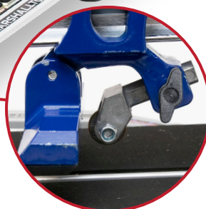
Multi-Level Adjustable Cutting Wheel