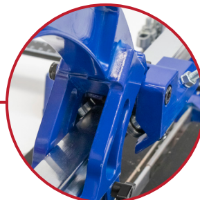
High quality bearings