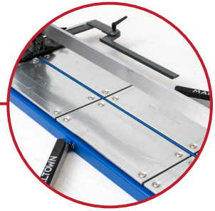
Spring-Loaded Support Bed