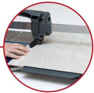
Rigid Rectangular Beam System