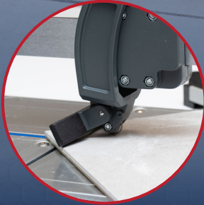
Tungsten Carbide Cutting Wheel