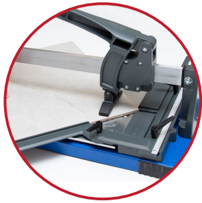
Protractor Gauge for precise angled cuts