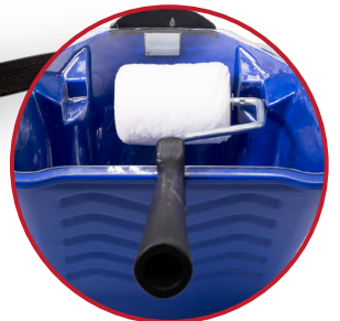
Brush & Roller Magnets