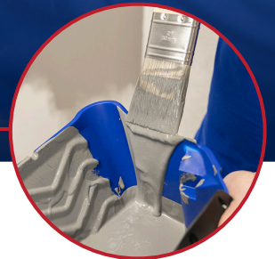
2 Wiping Blades