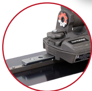
Gen3 MagVibe Package