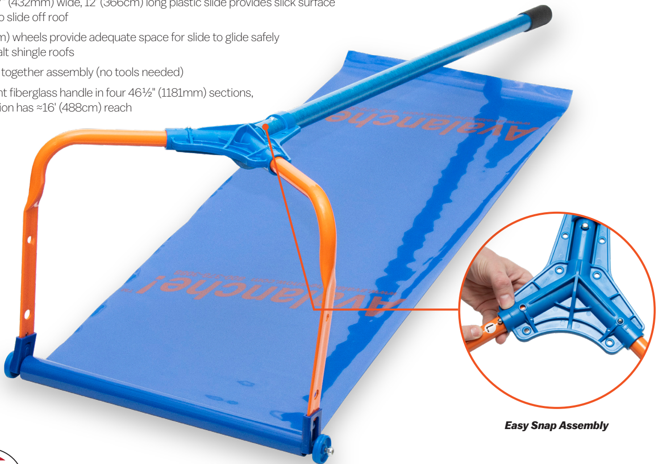
Easy Snap Assembly