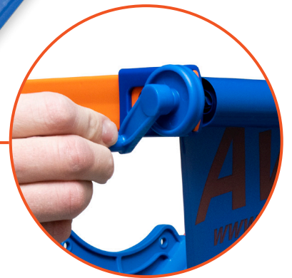
Slide Wheel Easy Wind-Up Handle