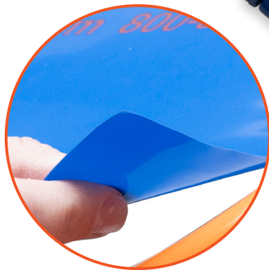
Slick Surface for Snow to Slide Off Roof