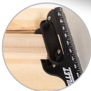
Accommodates a standard 2" x 4" or smaller