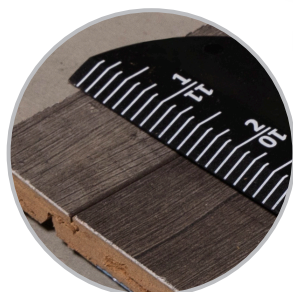
Clear, bold markings extend onto beveled edge for easy readability