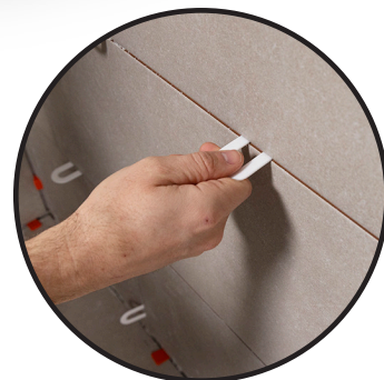
Easy to remove