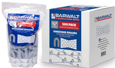
HTS15 & HTS3 sold in resealable bag, bulk packs sold in boxes