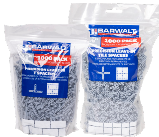
Spacers come in a convenient, resealable bag