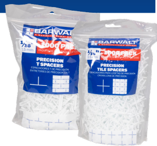
Spacers come in a convenient, resealable bag