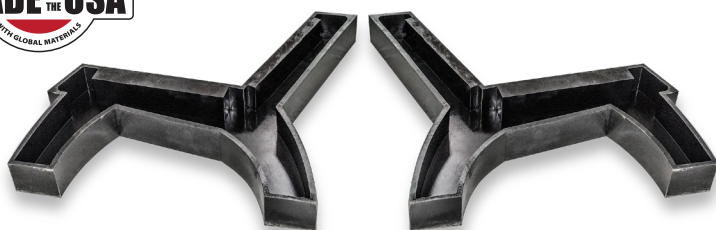
BMSREST (Set also includes backrest plank mold)