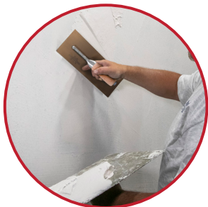
Short mounting provides increased flexibility and control