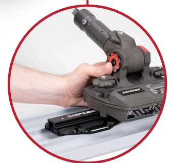
Includes QAS™ Male Mounting Plate