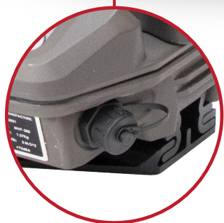
Sealed Charging Port