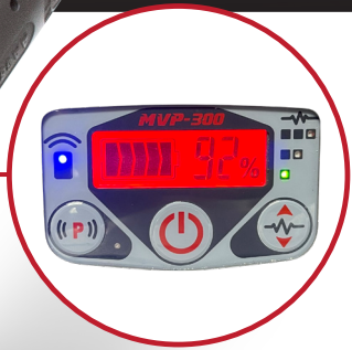
LED Battery Indicator