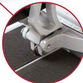
Tungsten Carbide Scoring Wheel