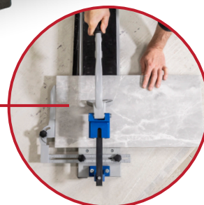
Support Extension Arms