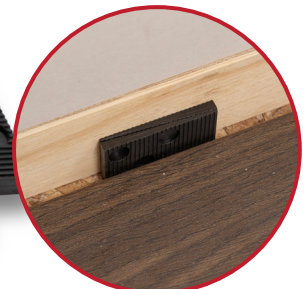
Spacers Lock Together