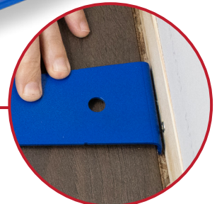
Fits in Tight Areas