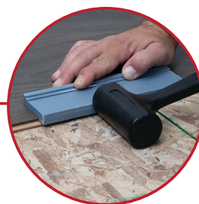
Improves Force While Reducing Damage