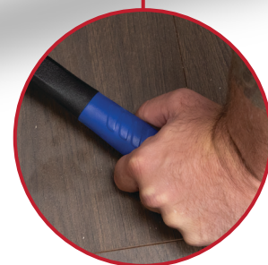
Non-Slip Textured Handle