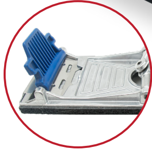
Quick-Change Locking Clamps