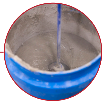
Quick, lump-free mixing