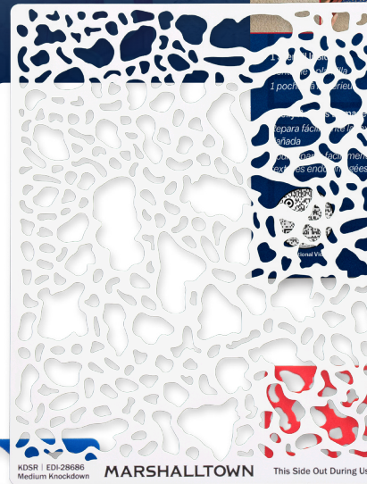
KDSR Medium Texture