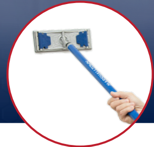
NO-FLIP SWIVEL BRACKET