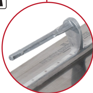
Diamond shank construction prevents handle from twisting and slipping

Long-lasting, durable blade made from highest grade hardened and tempered steel