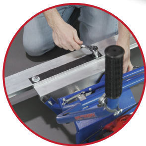
9" Hole Spacing