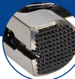
MILLED Grips nail heads to reduce slippage