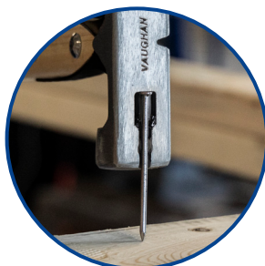
Magnetic Nail Holder