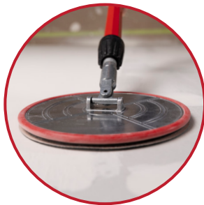
High-Fired Aluminum Oxide Grit